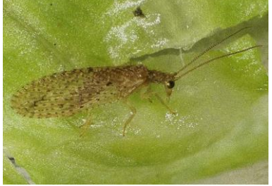
A Tasmanian brown lacewing adult ( Micromus tasmaniae ) with its distinctive lace-like wings.