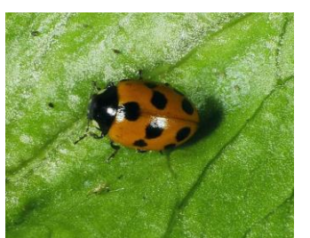
The eleven-spotted ladybird ( Coccinella undecimpunctata ) is known to attack aphids.