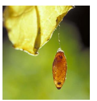
A Meteorus pulchricornis cocoon hanging from a lettuce leaf.