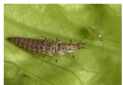
A Tasmanian brown lacewing larva ( Micromus tasmaniae ) attacking a currant-lettuce aphid.